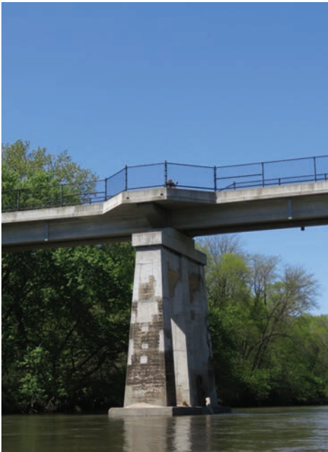
Heart of Iowa Nature Trail bridge

Although wildlife is less abundant than in the previous stretches, paddlers still are likely to see and hear some river animals. Canada geese, wood ducks, mallard ducks, and some bald eagles can all be found. Evidence of deer and raccoons can be seen in tracks and trails on the shoreline. Red-headed woodpeckers, song sparrows, and gold finches, all typical of more open woodland and savanna, can also be seen and heard along the route.