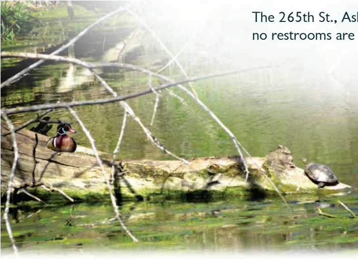
Wood duck drake and painted turtle

The 265th St., Askew Bridge, and C.J. Shrek Accesses provide ample parking but no restrooms are available.