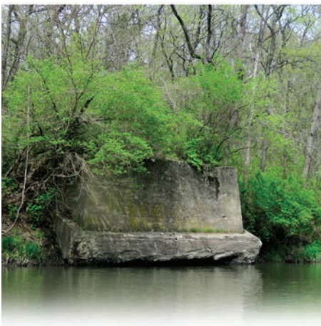
Remaining bridge abutments