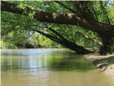
Shading silver maples

After passing under the Southeast 16th St. and U.S. Highway 30 bridges, the river flows along the southern edge of the City of Ames. The first third of this stretch is wooded with both bottomland and upland hardwoods. Below the Ames city limits, agricultural cropland dominates the landscape. River meanders are either hard-armored with old waste cement on the banks or are often actively eroding on the outside bends. Willows and other bottomland species occupy and hold the ground on the inside of the river bends. While some fields have grassed or treed buffers, others have none.