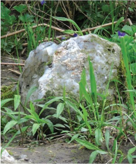
A chert nodule lies along the Skunk shore.

In places along the shore, low outcrops of limestone can be seen. Hard chert stones often were used by Native Americans for making tools. Today, paddlers just north of Sleepy Hollow may hear a loud boom occurring around 5:30 pm weekdays. It comes from modern mining of limestone near the Skunk River.