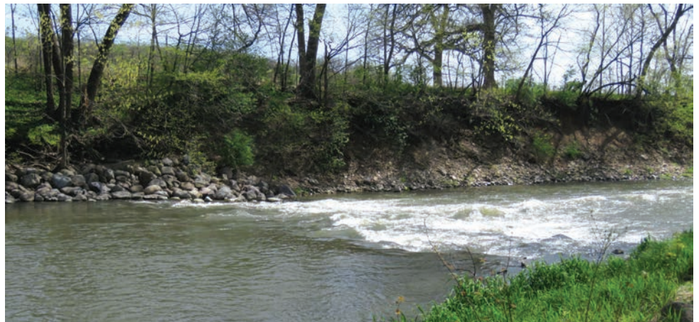
Soper’s Mill rock riffle dam

Dams and bridges are part of the history of the Skunk River. Paddlers will notice a bridge built by the CCC in the 1930s at Story City. Remains of bridge abutments and a mill dam remain at Soper’s Mill. A low-head dam where a mill once stood still can be seen near the Sleepy Hollow Access.