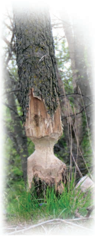
Signs of beaver activity

This river stretch is appropriate for paddlers of all skill levels.