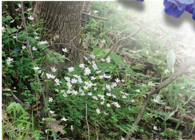
Anemones, violets, and other spring ephemerals