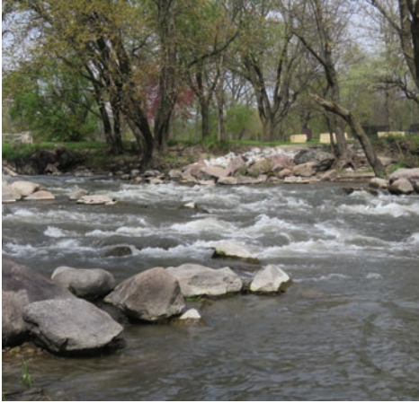
Story City rock riffle dam

Between Story City and the Lekwa Access the river meanders along a mostly wooded corridor of bottomland trees, silver maple mixed with some cottonwood, box elder, and sycamores. Some houses are visible along the shoreline and a bike/pedestrian bridge crosses the river within Story City limits. Deer are common and beaver-chiseled trees are found along the shoreline. The rock rapids at Story City Park were developed below the dam to improve habitat for fish and invertebrates.