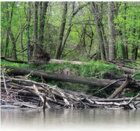
Dead trees in the water provide habitat and hazard.

The Skunk contains lots of fallen trees, often piled up in river meanders or hung up on sand and gravel bars. The brush provides important habitat for aquatic wildlife, but also may be hazards for paddlers.