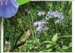
Wild phlox in bloom