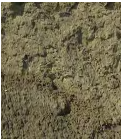
Sand, silt, and clay deposits.

A trip on the Raccoon River in Greene County takes travelers through a landscape of tall bluffs, hilltops with sprawling old oaks, and wild places with abundant wildlife. It is a place to experience nature, with few obvious signs of development. The river cuts through prehistoric glacial deposits in a modern agricultural landscape. The story of the river is one of natural features and human alterations, much of which is revealed on the water trail.