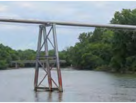
Upstream of the Adkins Bridge Access is a unique elevated gas pipeline.

Mid-river sand and rock bars are common throughout the stretch, and paddlers can get out of their boats and find mussel shells. Two oxbow ponds are evident in this stretch of river, formed when sharp river bends were cut-off by the water as it changed course. One oxbow is just above the Squirrel Hollow rock dam. The other is located just above E57 Bridge, and has recently formed. Narrow and still dotted with dead trees, the cutoff has views into the old meander on both ends, with floodplain cornfields clearly visible beyond.