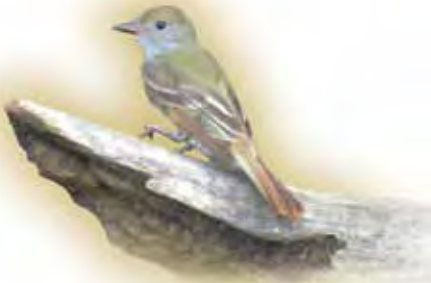
Great crested flycatcher